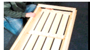
Underside of finished